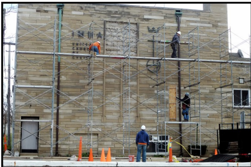
Left: Over view of the wall, while investigation in process

Please keep in mind that during this time 98th Street east bound from Campbell Ave remains closed until the north wall repairs have been completed. Please use the main front doors for entry to the church building. Additionally, Left turns are permitted on to 98th Street west.